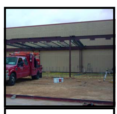
Miscellaneous Renovations / Terry HS