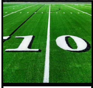
Traylor Stadium Renovations