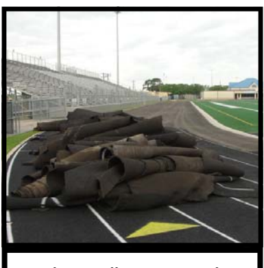
Traylor Stadium Renovations