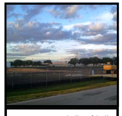
Lamar HS Baseball/Softball