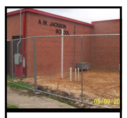
Miscellaneous Renovations / Jackson