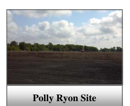
Polly Ryon Middle School