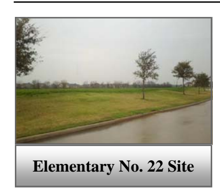
1---- N- 22