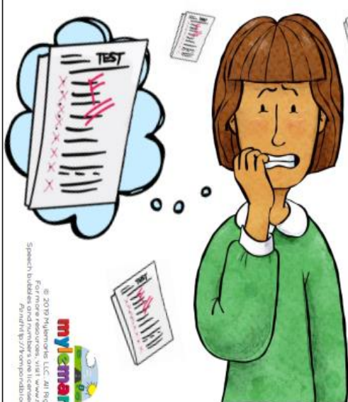
Illustration provided by Sarah Pecorino Illustration & Design www.sarahpecorino.com

© 2019 MyMentor, LLC. All Rights Reserved. For more information visit www.mymentor.com Speech bubbles and numbers are licensed from iStockphoto.com font: fontbundles.com