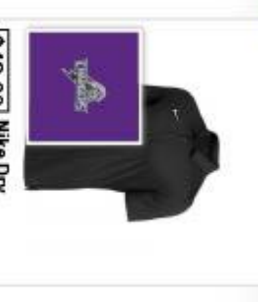
$42.00 Nike Dry Franchise Polo Available in 2 other colors.