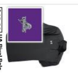
$42.00 UA Rival Polo Available in 2 other colors.