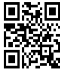
Build a Better World