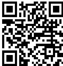
McNeill Library Facebook Page